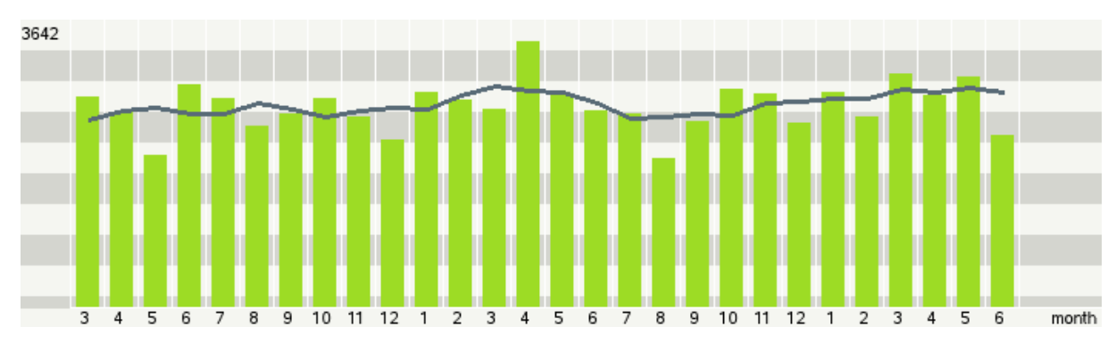
Monthly number of visits since March, 2007