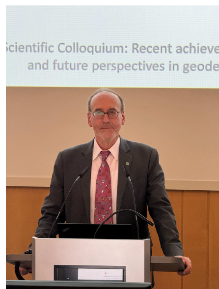
Prof. Harald Schuh

https://www.gfz-potsdam.de/en/press/news/details/verabschiedung-von-harald-schuh