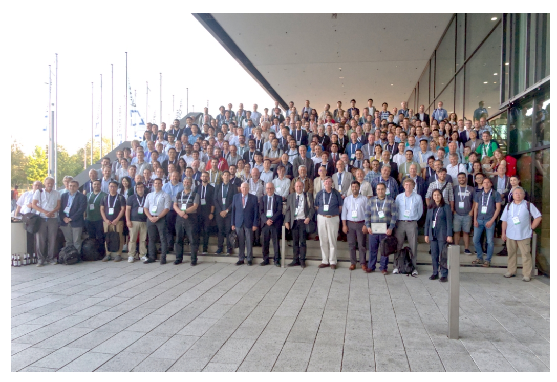
Group photo of the IAG participants